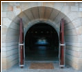
Michael Lyons - Architect

Generally the product is supplied in diamond sawn, split face or a mechanically tooled finish. The stone can be cut to our standard or specific sizes as required. The various sizes can be used in structural or veneered walling as cladding to suitable substrates and as paving to suitably prepared areas both internal and external. Cladding can be mechanically fixed to suitable walling systems.